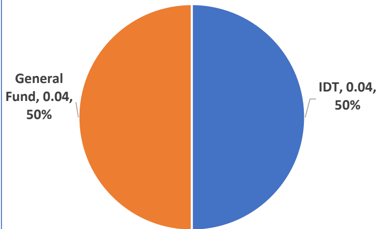
Governor's Recommended Budget FY 2021 ($ millions)

MISSION: The VOSHA Review Board (VRB) carries out its statutory mandate to provide reviews of and hearings on Vermont Occupational Safety and Health Administration (VOSHA) violations of safety and health standards in the workplace contested by Vermont employers